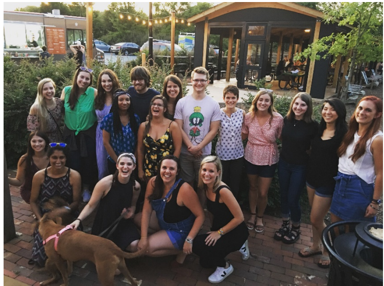
Welcome back from Summer - Program Social