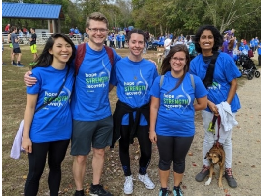
NEDA Walk in Charlotte